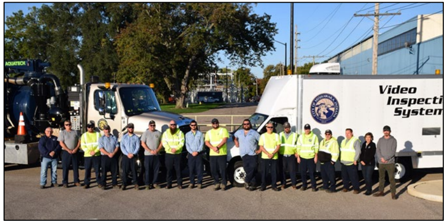
Sewer Maintenance Department

The Sewer Department cleaned a total of 97,468 feet of sewer lines and televised 94,776 feet of sewer lines in 2021. The collection system has over 200 miles of sanitary sewers and storm lines. Cleaning and televising are an important process in maximizing flow of sewage to the Wastewater Treatment Plant and