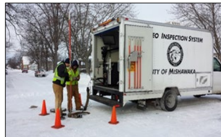
Video Inspection Truck

The video surveillance crew records all visual data and all manually documented information gathered. This information is uploaded to the City GIS Department and Engineering for further study and updating of the City GIS Map. Inspections of new sewer system extensions through sewer televising are conducted to ensure that the construction meets our City specifications.